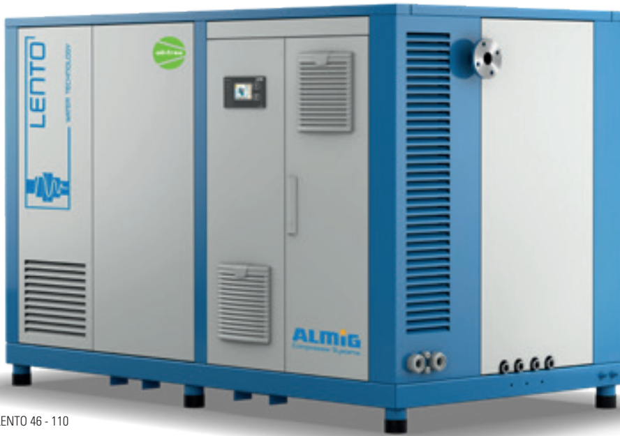
LENTO 46 - 110