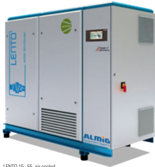
LENTO 15 - 55, air-cooled